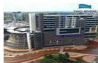
Two Rivers Mall