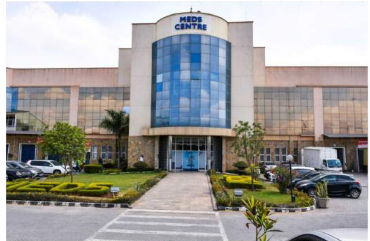
MEDS headquarters in Nairobi