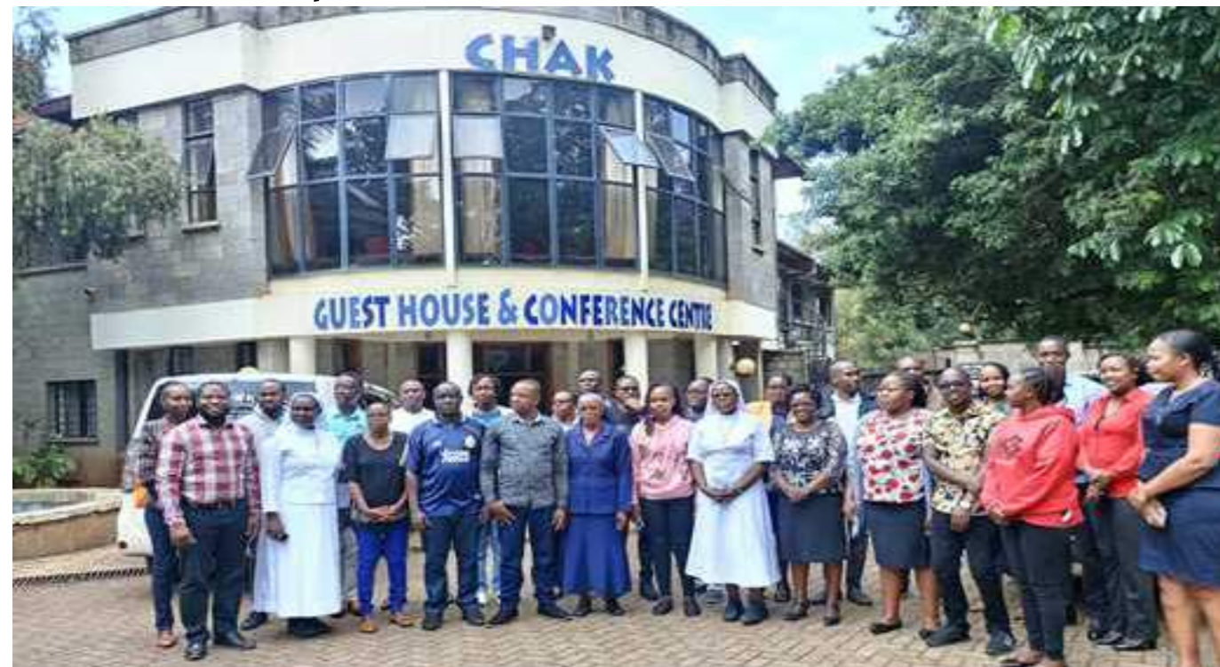
Participants pose for a photo after a facility based training by MEDS