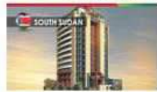
UAP Equatorial Tower Juba