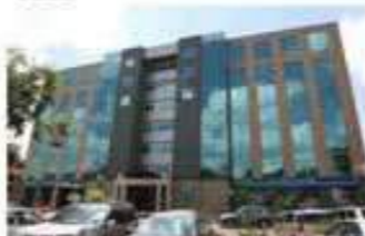
Standard Chartered Bank Westlands, East Africa Hub

(Images' State of the art commercial projects Trident Plumbers Limited mechanical works)