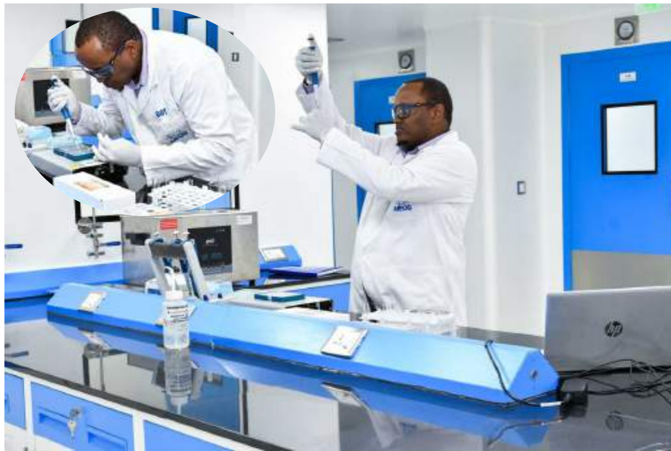
MEDS Microbiology Laboratory

In pursuit of this Mission, MEDS has three main functions: