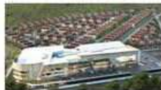
Safaricom Pension Scheme & Mall