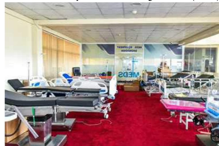
MEDS Medical Equipment room